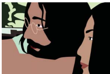
Kota Ezawa, from the video "Lennon Sontag Bueys", 2004. Courtesy of the artist and Haines Gallery, San Francisco.

Encompassing images from the recognizable to the obscure, the traveling exhibition John Waters: Change of Life will bring the iconic filmmaker's uncensored images out of the cinematic realm and into The Warhol. The exhibition is a retrospective of approximately 80 recent photographic and sculptural works and three early, unreleased films.